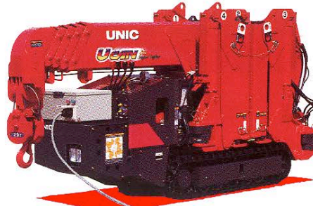
w295CMRS Gasoline and Electric