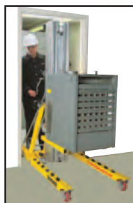
Fits through doorways!

Using plunger pins, forks remove and reverse easily for added height or to get flush with a ceiling. No loose pieces!