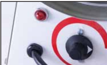
Ultra Models include illuminated diagnostic light for convenient troubleshooting

Engineered to deliver reliable, directional heat, L.B. White Tradesman heaters feature a unique 3-trial ignition system, the industry's heaviest gauge combustion chamber and burner plate, and Self Diagnostic Service Saver models for convenient trouble-shooting.