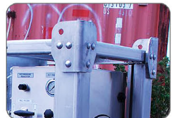
Heavy duty stainless steel frame, forklift/pallet jack pockets, 5x tested lifting eyes.