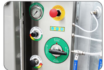
Patent pending engineered TRX Flow Dynamics