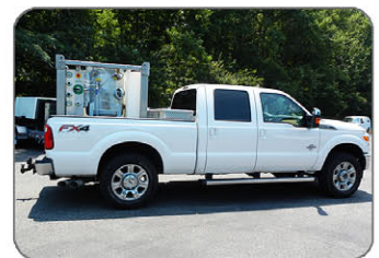
Compact enough to fit in a standard 6' pickup with tool box.