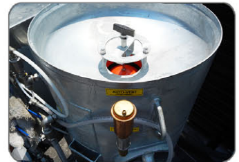
6.5-CF, hot-dipped galvanized, spring-sealed blast pot with auto vent.