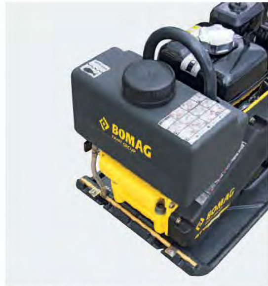
An optional water sprinkler system with 7 l tank capacity for asphalt work.

Smart design! The steering arm folds to simplify storage on warehouse shelves and for easier site-to-site transport.