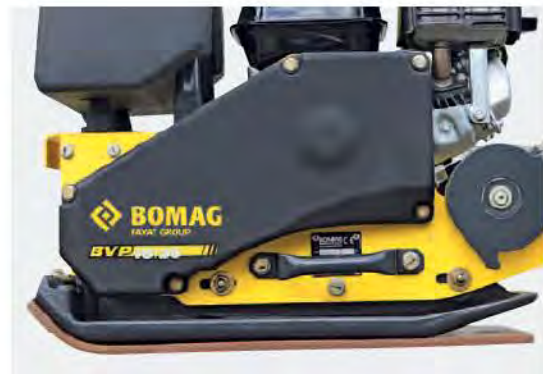
Plastic mat option for block paving work.