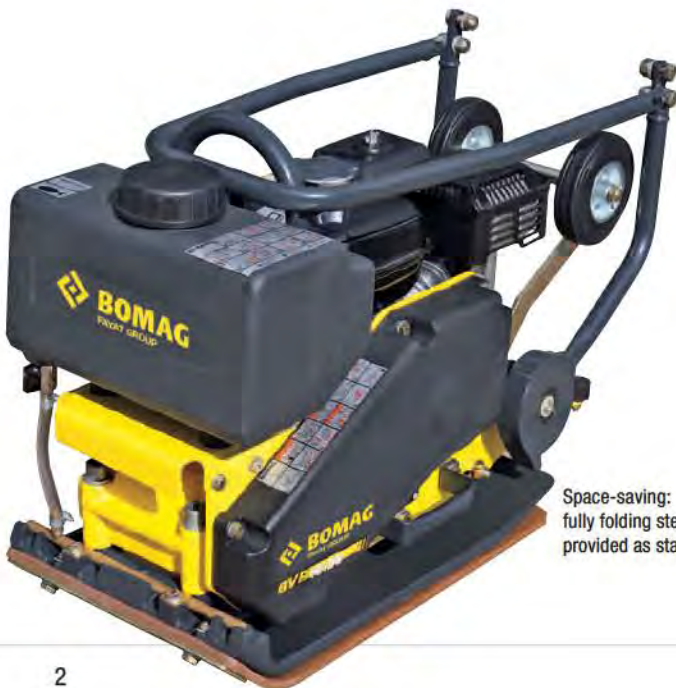
Space-saving: fully folding steering bow provided as standard.