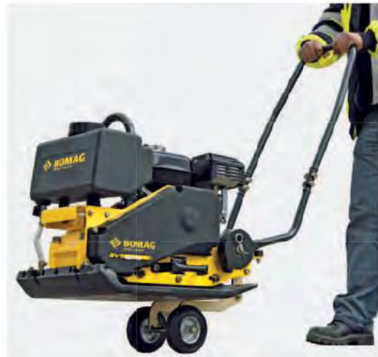
Transport wheels option for added mobility.