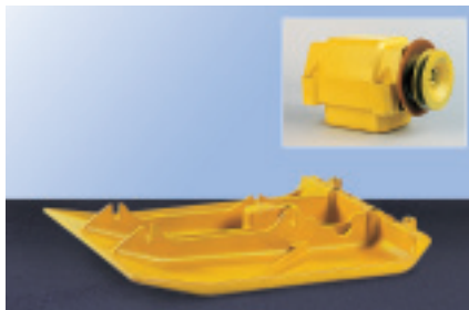
The exciter is oil lubricated and the housing is fully sealed.