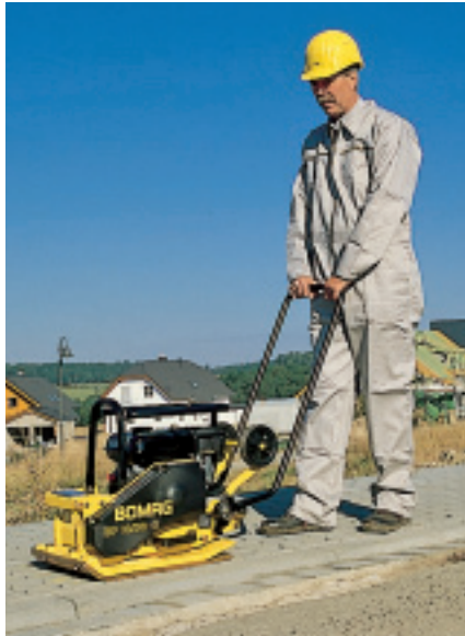
Compacting paving blocks with vulcolan mat