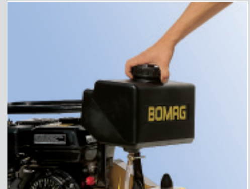
The water tank is fixed without screws for quick and easy removal