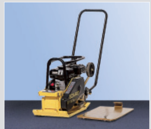
Quick-fit vulcolan mat