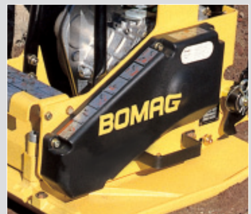
Operating decal illustrates proper operation methods

With these features and many more, it's easy to see why these models maintain a high residual value while delivering lower lifetime operating costs.