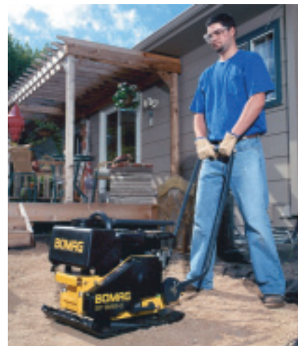
Excellent performance on granular materials