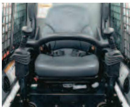
More Operator Comfort

State-of-the-art instrument panels provide dozens of operational features, diagnostics and monitoring. Optional deluxe instrument panel includes keyless start security system, feature lockouts, digital time and job clocks, multi-language display, even a "help" menu.