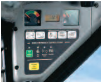
Left Side Instrument Panel

Bobcat S175 and S185 loaders deliver a wide range of innovative, operator-friendly features and exciting value-added options.