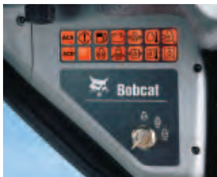
Right Side Standard Instrument Panel