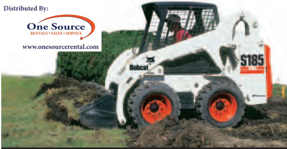
Bobcat engineering sets the standard for comfort, visibility and performance!