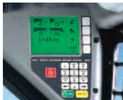
Optional Deluxe Instrument Panel

State-of-the-art instrument panels provide dozens of operational features, diagnostics and monitoring. Optional deluxe instrument panel includes keyless start security system, feature lockouts, digital time and job clocks, multi-language display, even a "help" menu.