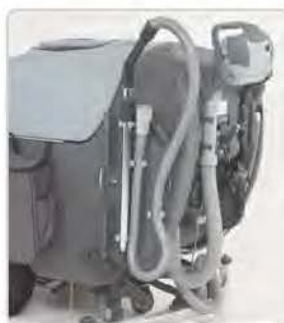
Onboard Scrub-Vac System

14600 21st Avenue North Plymouth, MN 55447-3408 www.advance-us.com Phone 800-214-7700 Fax 800-989-6566