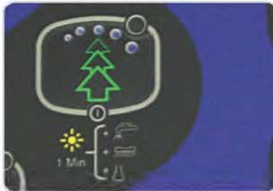
EcoFlex™ System models have One-Touch™ activation for an on-demand cleaning burst of power.