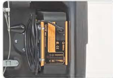
An onboard battery charger for optional wet or gel battery packages lets you recharge the machine from any outlet.