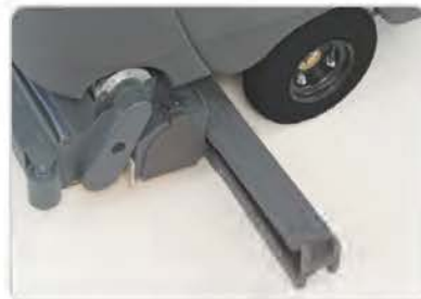
Cylindrical scrub decks sweep and scrub in a single pass with dual counter-rotating brushes.