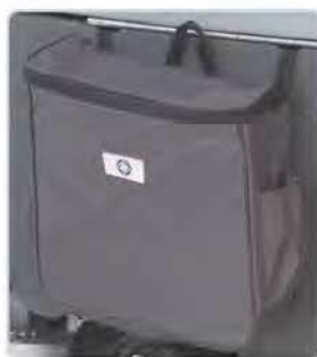
Onboard Tote Bag