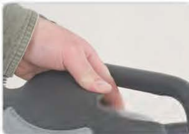
Ergonomic Soft-Touch™ paddle system provides simple, intuitive control and safe operation. Up to 20% greater productivity compared to simple switch controls.