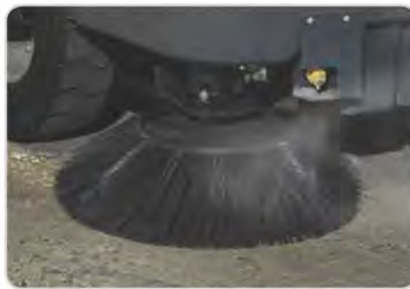
DustGuard™ suppresses airborne fugitive dust where most dust is generated – at the side brooms