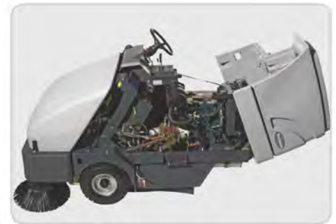
MaxAccess™ allows faster repairs and less downtime so the sweeper spends less time in the shop and more time sweeping