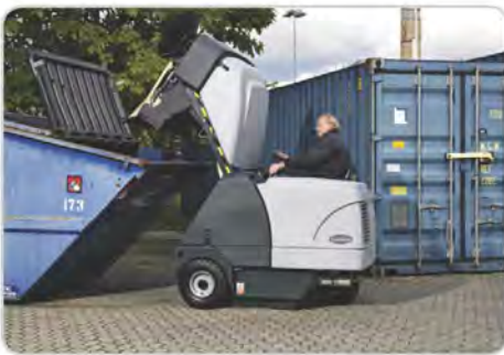
Variable dump height of up to 62 inches allows fast and simple disposal of swept debris